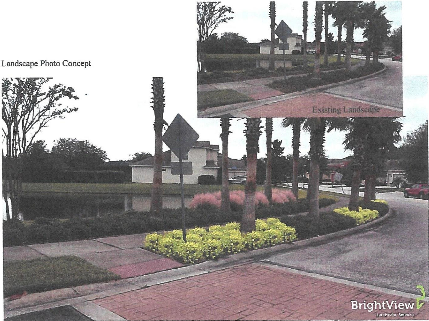
Landscape Photo Concept